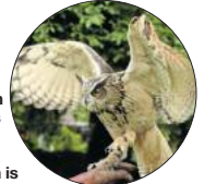
■ Pictured, a European Eagle Owl

For more information of the Armed Forces fun day visit www.inswindon.com